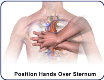
Position Hands Over Sternum