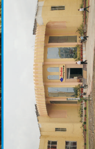
Index Nursing College