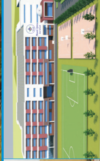
Mount Litera Zee School