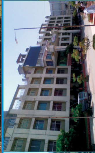
Index Institute of Dental Science